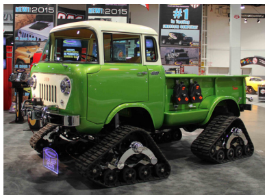
In the category of 'something for every taste,' this 1958 Jeep FC170 with custom four-track drive was a crowd favorite at Daystar's SEMA 2014 booth.

This new offering has been on our radar for some time and the new IPG portal provides the technology to make it happen. Stay tuned for further details. IPG